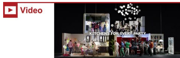
2010 Ikea - Kitchen Party

In October 2010 IKEA launched a 60-second commercial on ITV during "The X Factor" ad break, presenting a new version of Jona Lewie's 1980s hit "You'll always find me in the kitchen at parties". The new version of the 80's hit was performed by the up-and-coming UK group Man Like Me and remixed by Arthur Baker. The band and Jona Lewie appear in the video.