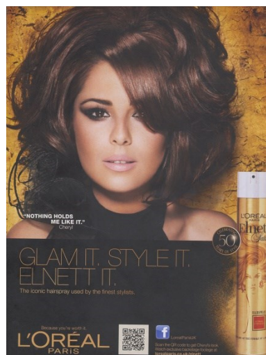
2011 L'Oreal - Cheryl Cole