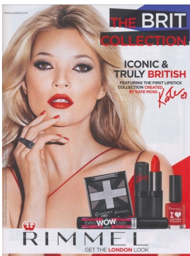
2011 Rimmel - Kate Moss

In an age where reality television is dominating the ratings, the line between celebrity and the average boy/girl next door is increasingly blurred. And the trend carries over into advertising. But how does a brand determine whether a celebrity would work better than a real person in their campaign?