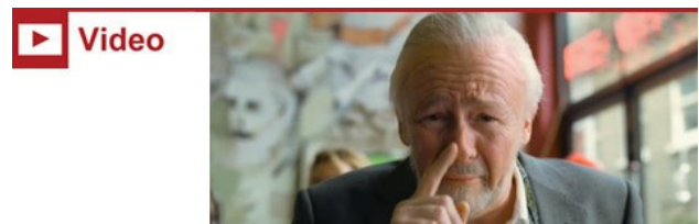
2010 Aviva - Silver Surfer

Paul Whitehouse, the comic, has been the main focus of Aviva commercials in the last few years in which he plays a number of comic characters in different situations. For example, the football supporter taking his companions to away games, an elderly Welsh 'goth' who collects antiques, and a deceased father figure providing life insurance to his grieving family.