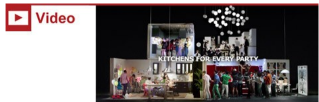
2010 Ikea - Kitchen Party

In October 2010 IKEA launched a 60-second commercial on ITV during "The X Factor" ad break, presenting a new version of Jona Lewie's 1980s hit "You'll always find me in the kitchen at parties". The new version of the 80's hit was performed by the up-and-coming UK group Man Like Me and remixed by Arthur Baker. The band and Jona Lewie appear in the video.