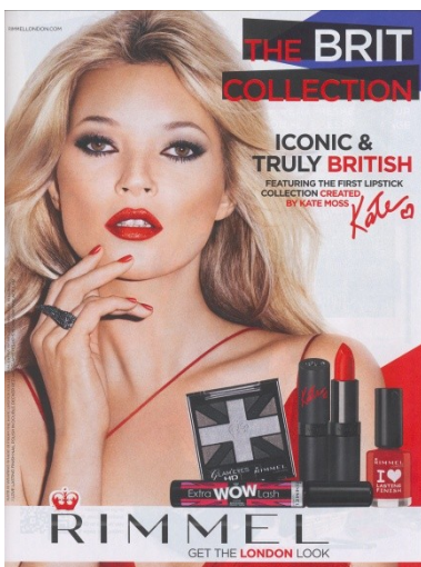
2011 Rimmel - Kate Moss

In an age where reality television is dominating the ratings, the line between celebrity and the average boy/girl next door is increasingly blurred. And the trend carries over into advertising. But how does a brand determine whether a celebrity would work better than a real person in their campaign?