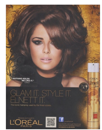
2011 L'Oreal - Cheryl Cole