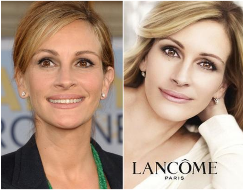
Left: The real Julia Roberts in 2011